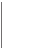
Seal of the Bank