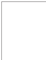
2 nd Holder