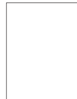
3 rd Holder

7. Account holder(s) details as per Bank Records